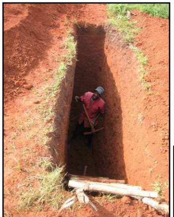
A start was made on the digging of the pits whilst we were still in Uganda. The toilets were in kit form.