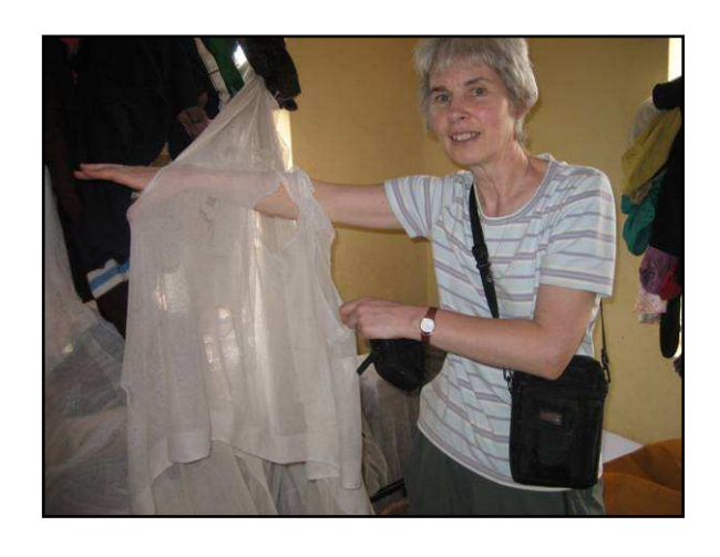
...and one of the new ones – on a triple-decker bunk bed.

One of the most popular gifts this year was mosquito nets and very welcome they were too! Take a look at one of the old nets that was in use a few weeks ago.